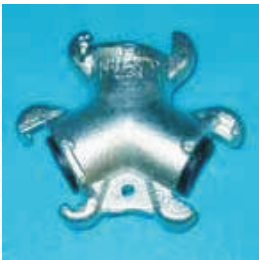
3 Way Connector Part No. UCTC - 25

Uses 3 sets of 2 lug connectors to provide an extra outlet from one air source. Malleable Iron Plated.