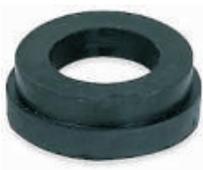
Washer for 2 Lug Universal Part No. GUC - 19