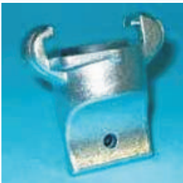
Dead End Part No. UCP - 25

Uses 3 sets of 2 lug connectors to provide an extra outlet from one air source. Malleable Iron Plated.